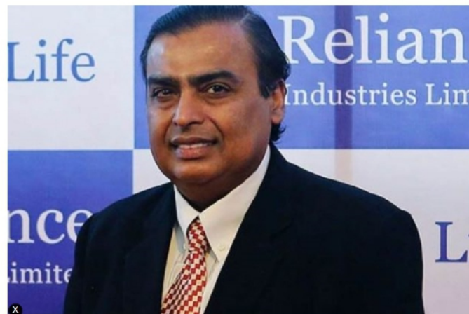
The Mukesh Ambani-led company will ramp up production capacity of face masks to 100,000 per day as he health workers struggle in the country to get right equipment.

Mukesh Ambani's RIL has mega plans to fight coronavirus, with the conglomerate planning to deploy the capacity of all its arms including Reliance Retail, Jio and Reliance Foundation to help the government.